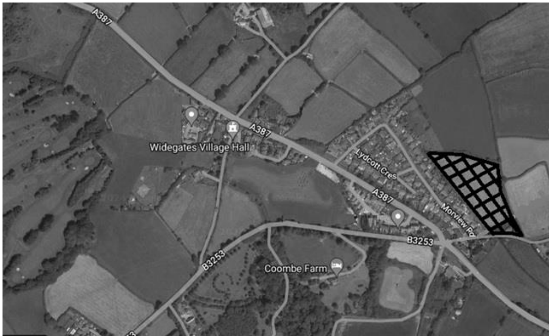
The hatched area shows the location for the proposed development

against the plans. This is likely to start in mid February. In the meantime, parishioners can email planning@cornwall.gov.uk and also make their views known to our Parish Councillors, to support them in their deliberations in advance of the formal consultation process. Morval Parish Council is due to meet in Widegates Village Hall at 7pm on Wednesday 7 th February.