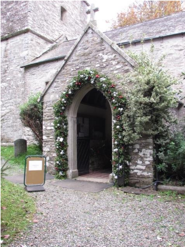
Approaching the church porch