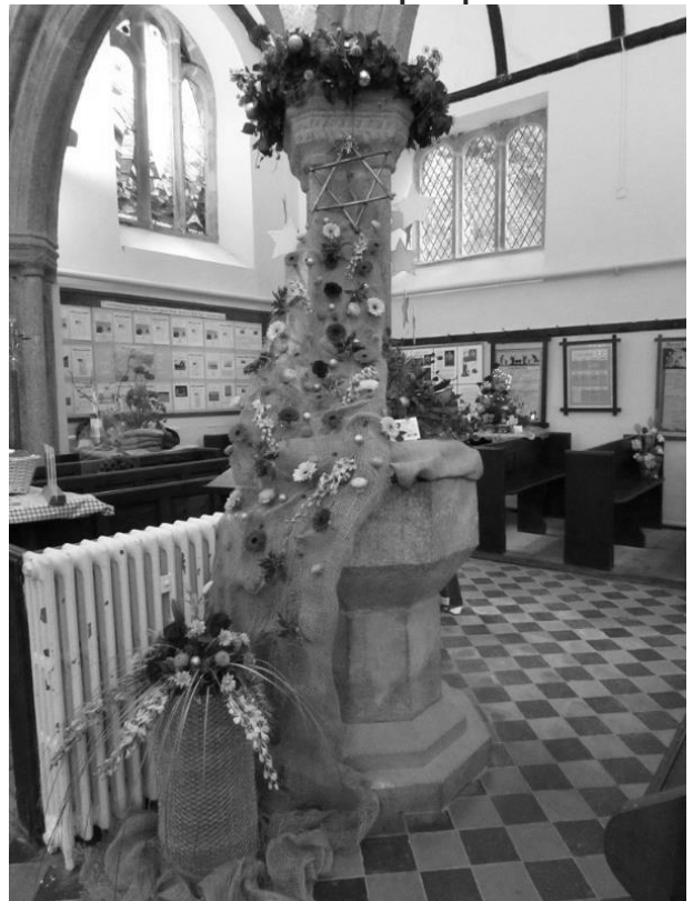
Near the font