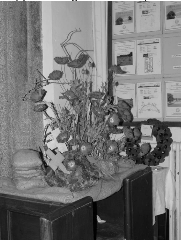
The poppies at the Memorial