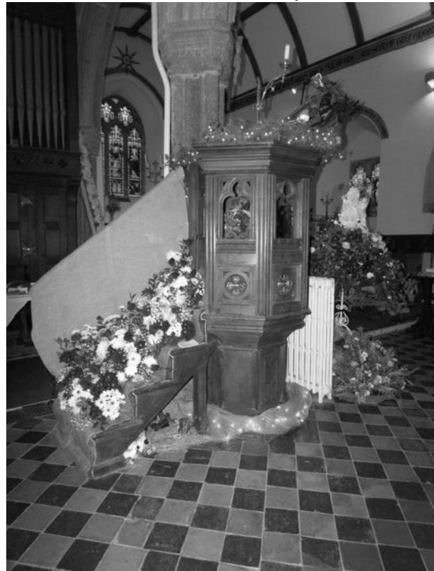
Near the pulpit