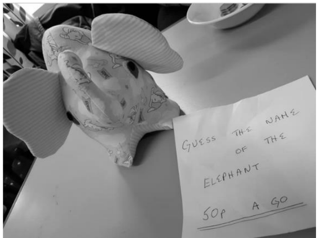
(iv) guess the elephant's name