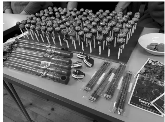
(ii) lollipop tombola