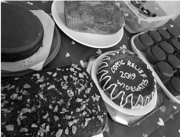
(i) display of cakes

During the recent Comic Relief charity fundraiser, many people and communities across the UK got involved, and Widegates and Morval were no exceptions, with an excellent Comic Relief Coffee Morning held in Widegates Reading Room the day after the main televised event. There were cakes galore for people to have a slice with their coffee, and many other things, including 'guess the elephant's name' a lollipop tombola, and a children's activity table.