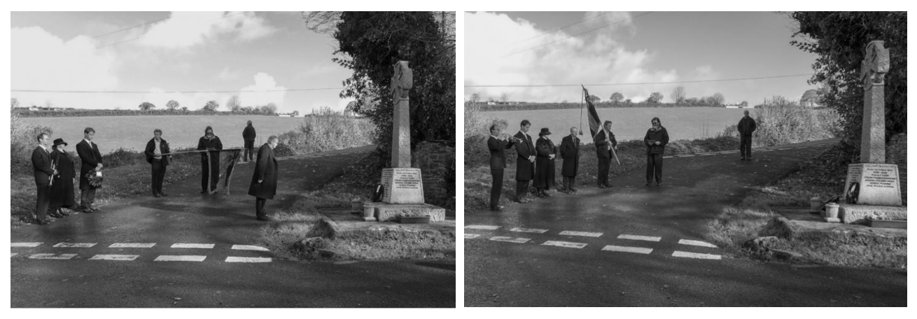
Laying wreaths on Remembrance Sunday Bugler playing Reveille at the War Memorial

Just a few days prior to the service, I was delighted to receive a call from Morval Parochial Church Council, asking if I would lay a wreath on their behalf at the Armistice Day service. This was an unexpected honour, and it was a great privilege to accept this accolade on behalf of myself and family.