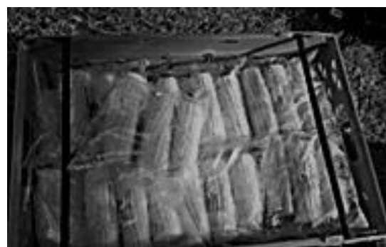
Some of the food rescued by TRJFP team.

The scheme is very challenging with difficult logistics and lots of people and food to organise! There are pick-ups from local shops, supermarkets, restaurants and farms up to four times a week, stock takes, auditing all the food that is collected, storage, cooking and serving the meals there is a lot to be done each week. ‘We record everything we intercept and add it to a nation RJFP database so that a body of evidence is being collated. We hope this information will be used to change the way our food system and food waste is managed’ says Jess. TRJFP Plymouth relies heavily on their 30 volunteers who contribute to all aspects of the business.